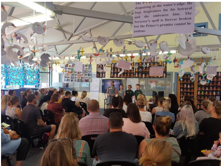
Year 6 captains - Kinder 2019 orientation morning

Enquiries call Tania Wilson 0417 416 678