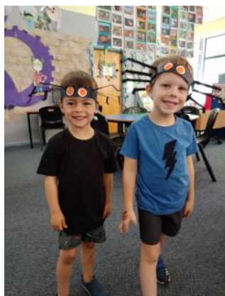
Pre-schooler's enjoying storytime in our library