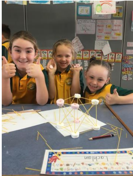
Elise, Ava, Lila 1 Gold