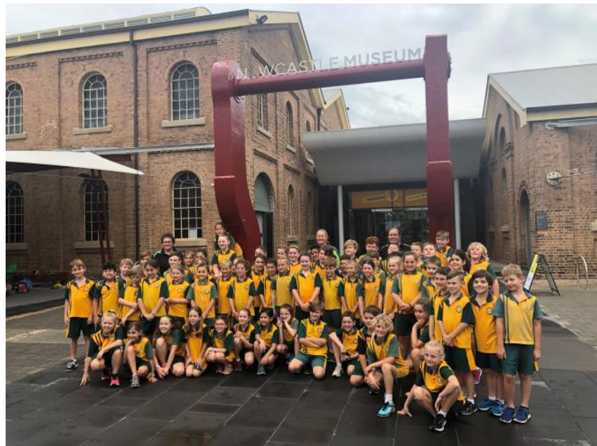
Year 3 Excursion to Newcastle Museum