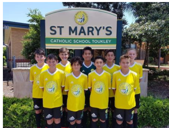
St Mary's Soccer Team