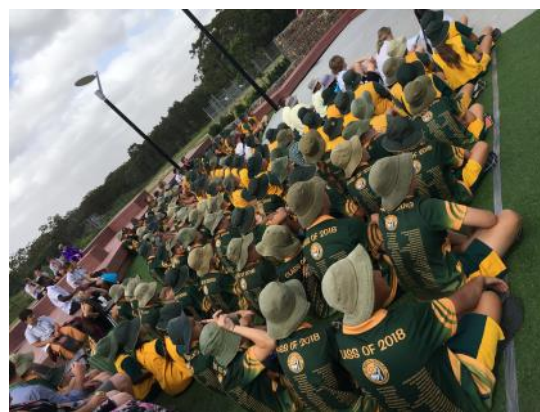
St Brigid's Catholic College - Year of Youth Cross Liturgy