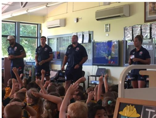
Sydney Roosters visit