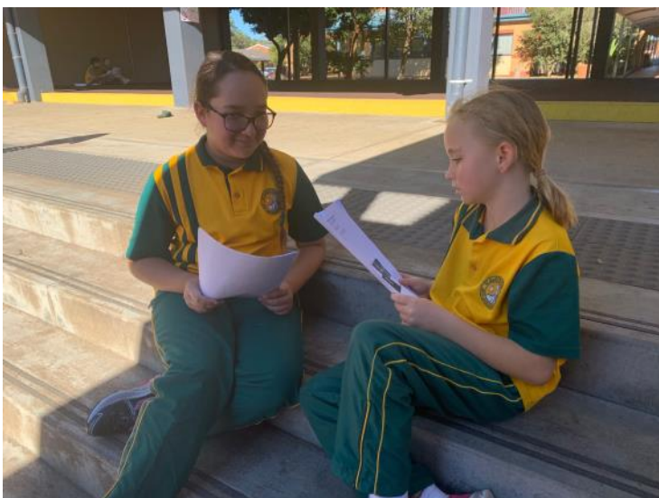
5 Gold practicing their presentations