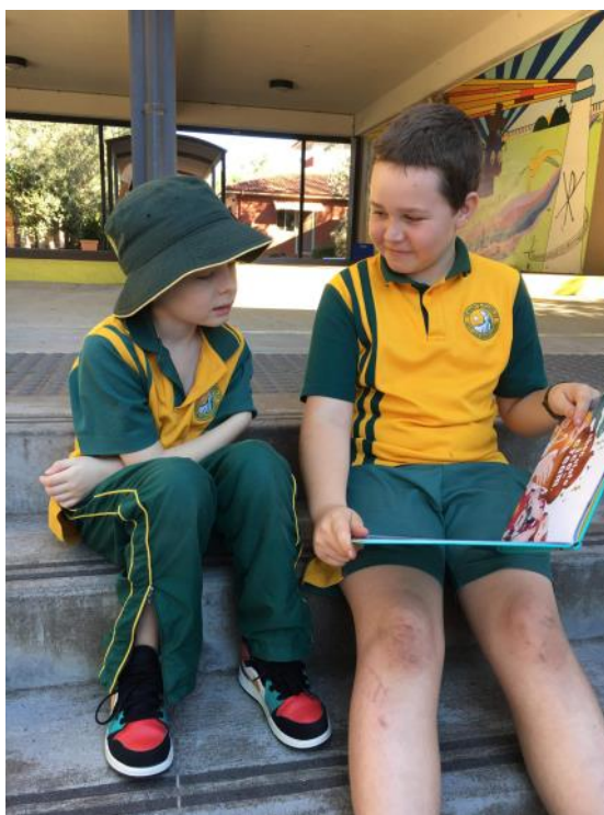
5 Green students reading with Aspect students