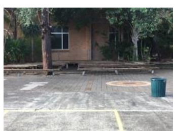
The Next Day