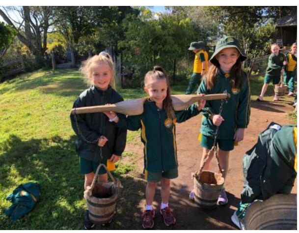
Year 2 Excursion Tocal Homestead