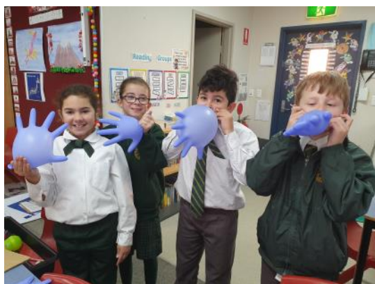
4 Gold Art making