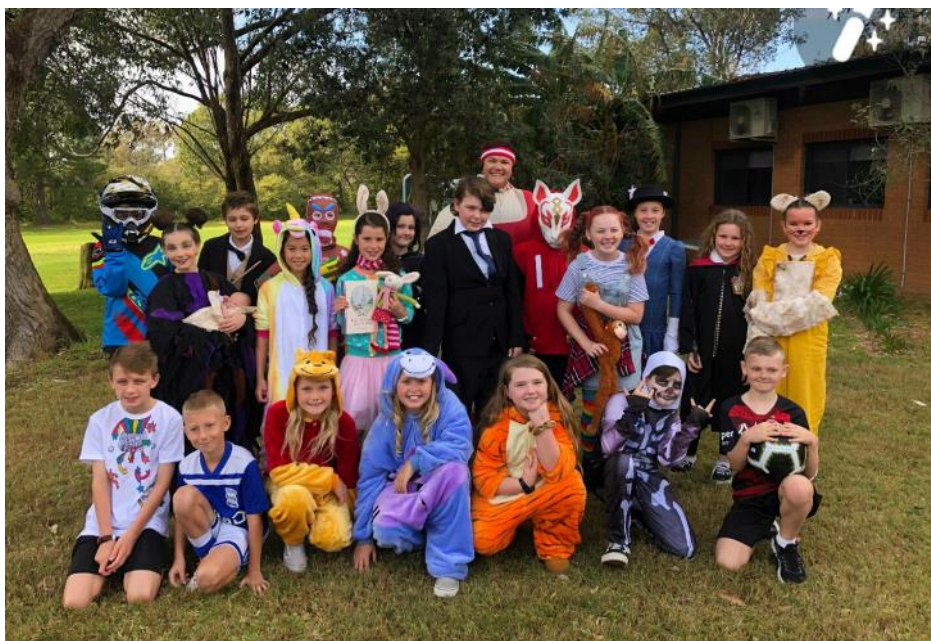
4 Green - Book Parade