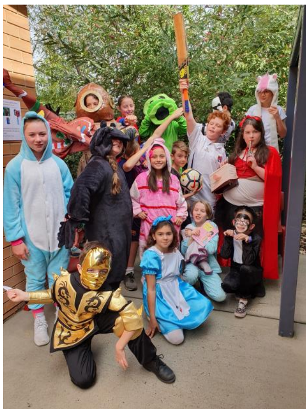
4 Gold - Book Parade