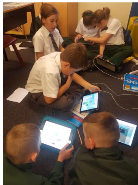
4 Green - Mathematics Challenge