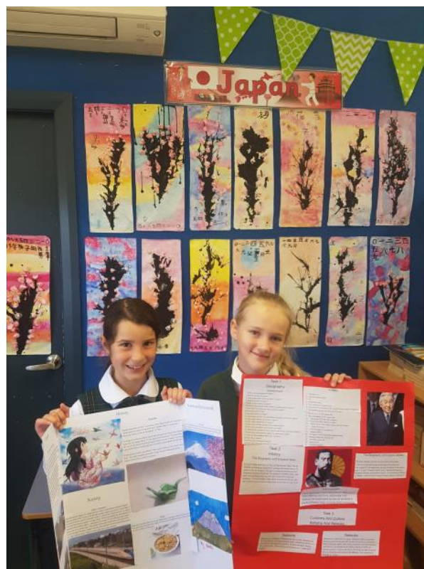
4 Green - Japanese art & information reports