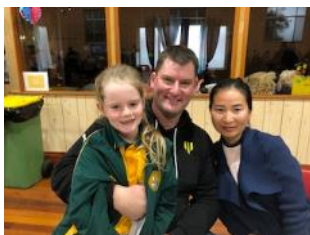
Father's Day Breakfast