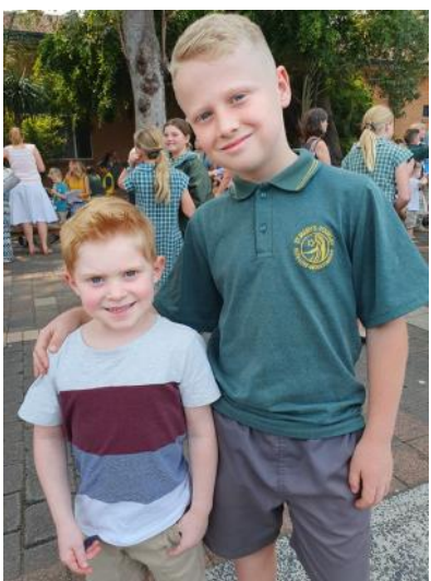
Our Kindy 2020 children with their buddies