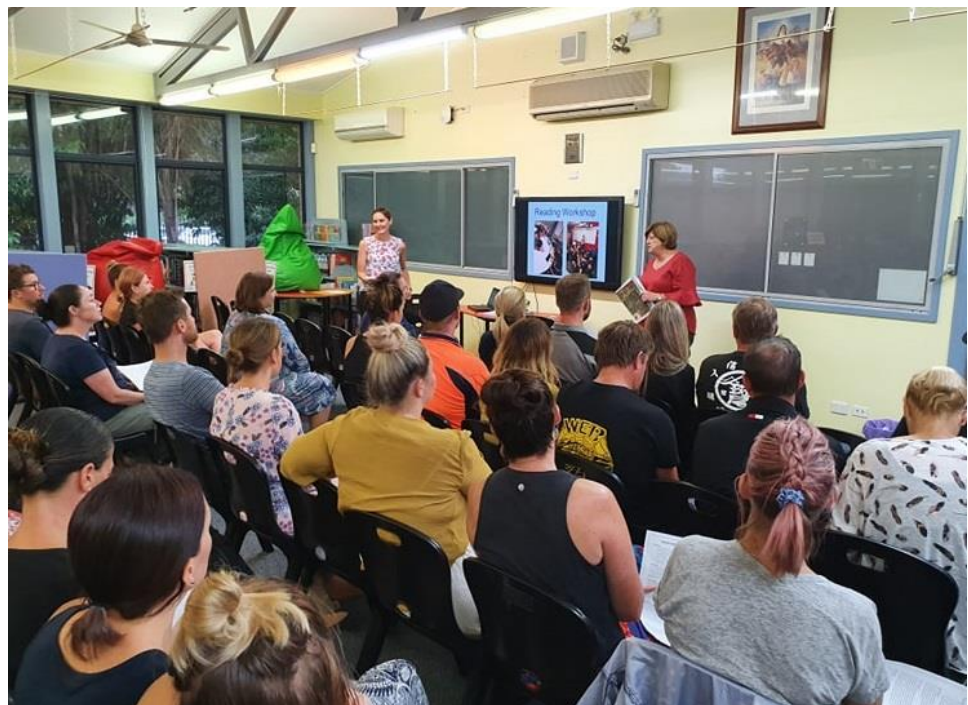
Kinder Parent Evening