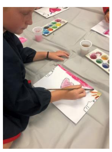
2 Blue have been exploring Bible stories through Biblical micrography