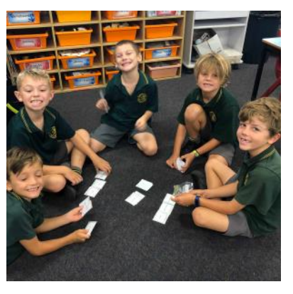
2 Gold have been practising skip counting & making sentences