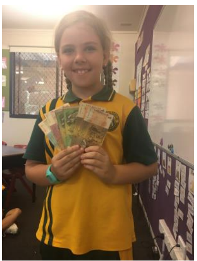
Students from 2 Green were asked to bring in artefacts from their home to talk about for our History unit - The Past in the Present