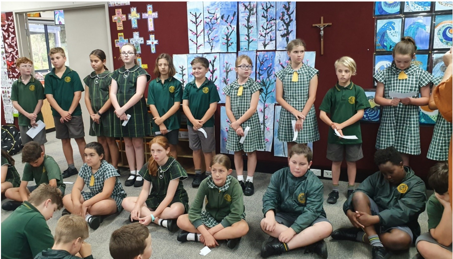
Year 4 Liturgy