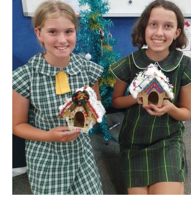
4Green Christmas craft