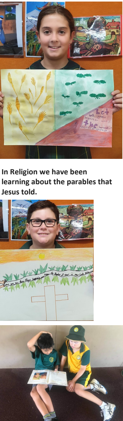
In Religion we have been learning about the parables that Jesus told.