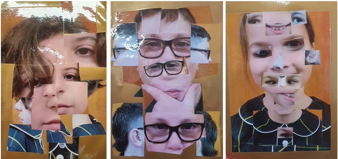
Year 5 students have experimented with cubism. Can you guys guess who is in these self portraits?