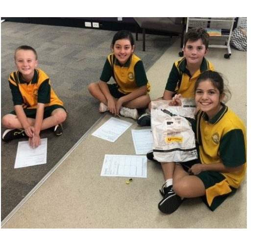
4Gold exploring properties of packages in Science