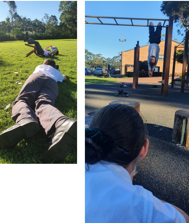
Year 5 art class: Taking Forced Perspective photographs...