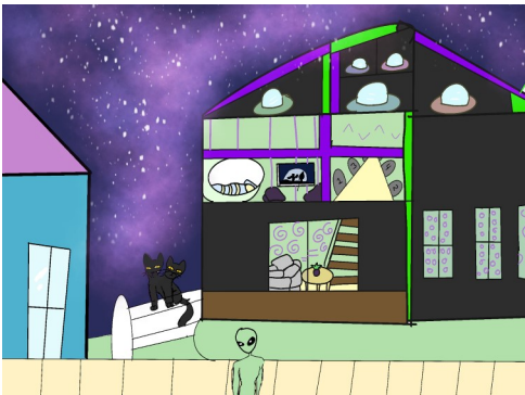
Here are some pictures from across Year 5 during HBL. There are some images of their artwork and also pictures of the children sharing their favourite places to read a book.