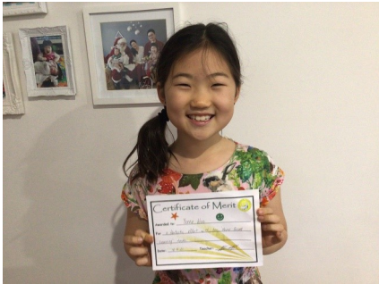
Student’s receiving their merit awards at home