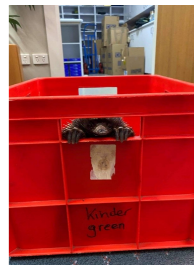
We had a little visitor in our office this week