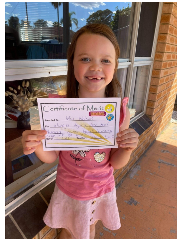
Student receiving their merit award at home