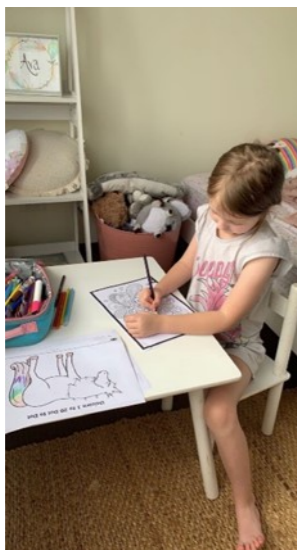
Home based learning fun....