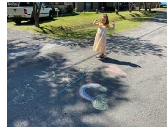
More sidewalk art