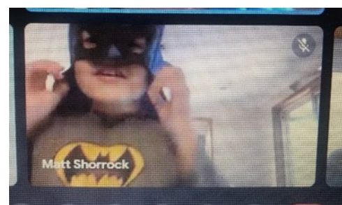
And some book week dress up fun!