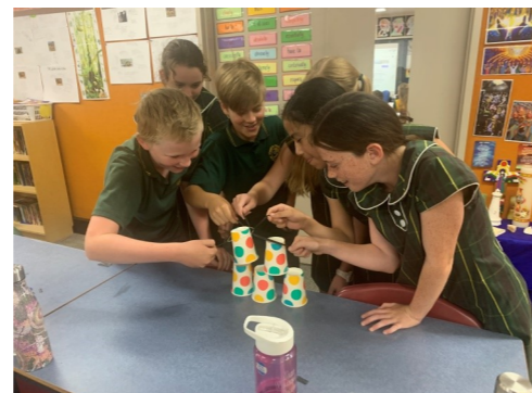
5Gold enjoying some group activities. Concentration levels were high.