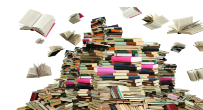
This Photo by Unknown Author is li-