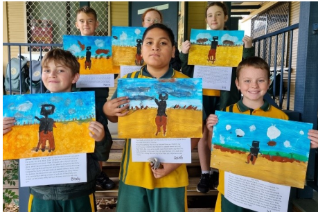
Year 5 have been inspired by the Ned Kelly series by artist Sidney Nolan. They have written a descriptive narrative on his most famous artwork titled Ned Kelly and have created their own interpretation of the piece.