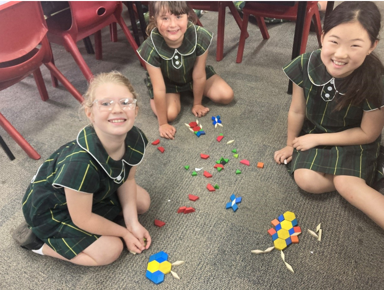
3 Blue enjoyed exploring shapes and symmetry in Maths