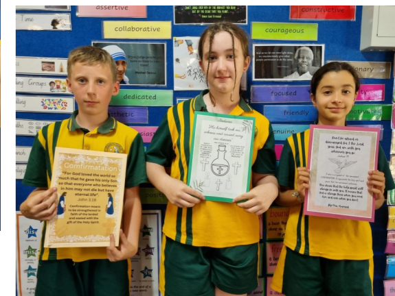
5 Gold have created amazing posters about the 7 Sacraments.