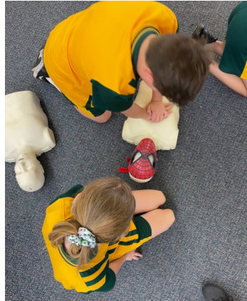
5Blue Leadership Wall & CPR Training