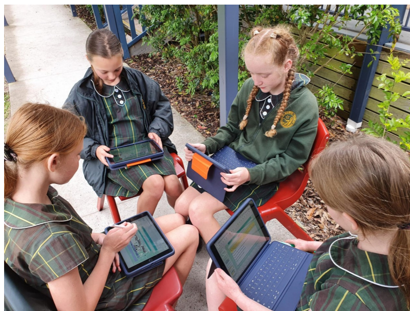
Book Club in 5Green